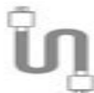
Cavo di tipo C.