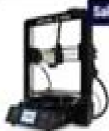
Anycubic I3 $309.99 MEGA Full Metal