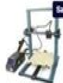
Creality3D CR - 10 $369.99 3D Printer