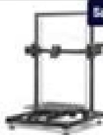
Tronxy X3S $285.99 Aluminum Frame