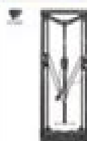
Anycubic Koss $169.99 Upgrd Pulley Versio Unfinished 3D F - WITH PRIN MATERIAL BRACKET BLA