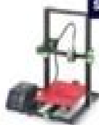
TEVO Tornado $359.99 Most Assembled Full Aluminum Frame 3D