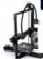
Tevo Tarantula $175.99 3D Printer