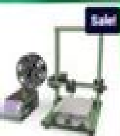
Anet E10 Aluminum frame $259.99 Multi- language 3D Printer DIY Kit EU US UK