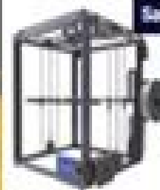
Tronxy X5S $319.99 High-precision Assembly Metal Frame 3D Printer -