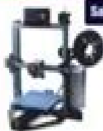
Zonestar Z5F $209.99 Fast Installation DIY 3D