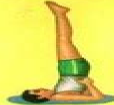
उर्ध्वसर्वांगासन URDHARV SARVANGASAN