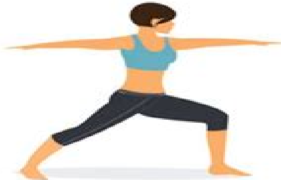
5.- Guerrero II