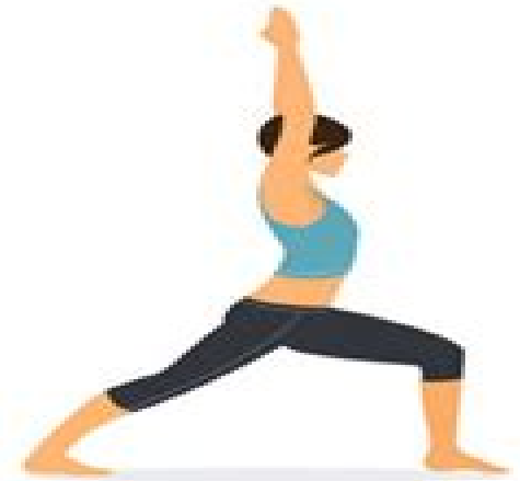
4.- Guerrero I