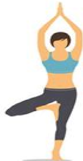
7.- El Árbol