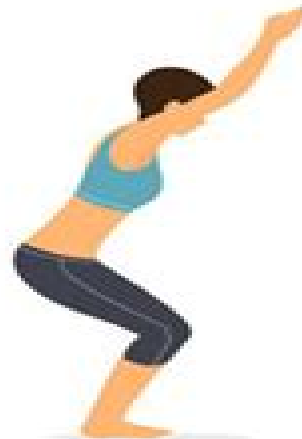
3.- La Silla