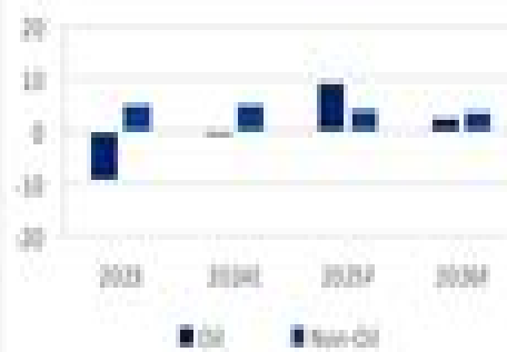
The UAE, Growth of Oil and Non-Oil GDP in Real Terms (%), 2023 - 2026F