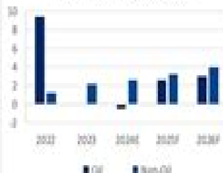
Qatar, Growth of Oil and Non-Oil GDP in Real Terms (%), 2023 - 2026F