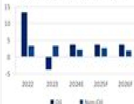
Oman, Growth of Oil and Non-Oil GDP in Real Terms (%), 2023 - 2026F