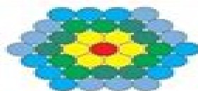
Hex Numbers p. 194

“Wide-ranging, visually appealing, entertaining.”