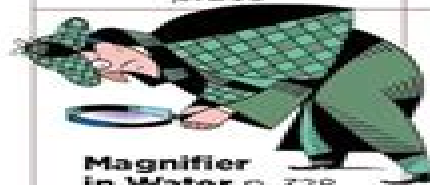
Magnifier in Water p. 328