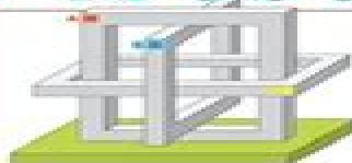
Nesting Frames p. 3