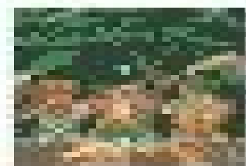
The Little Red Riding Hood by the author 10 pages, 10 songs, 10 games 10 pages