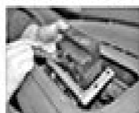
11.48 Release the retaining clip, and remove the head from the top of the conditioned only further from the mounting bracket