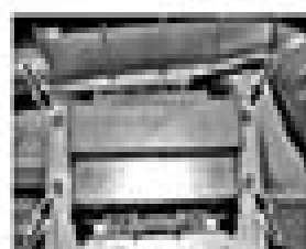
11.47 Under the four bolts (previously) securing the head, insert the mounting bracket in the block