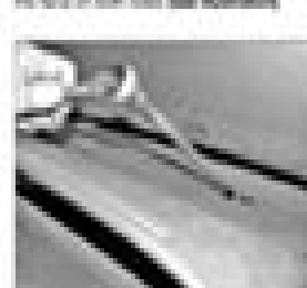
11.47a Then remove the four upper retaining bolts