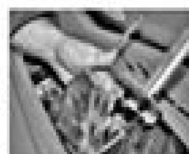
11.49 Then remove the bracket

38. Working through the storage tray, separate under the four bolts securing the brackets and mounting bracket in the block (see illustration).