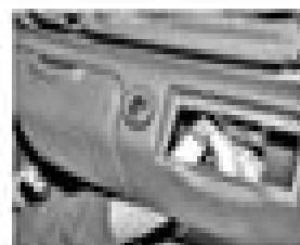
11.45 Disconnect the wiring connector from the opposite lighter