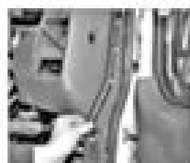
11.49a Release the retaining clip and remove the head upper from the face on both sides