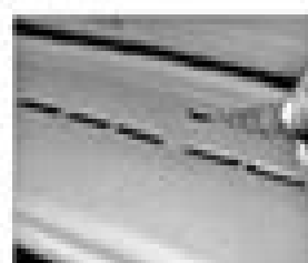
11.46a Lift off the two covers

45. Under the four outer mounting bolts from the face on both sides (see illustration).