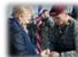
Adaptive Professionals and Institutions to operate in complex environments

The Army of 2025 and beyond will be prepared to fight and win in a complex world because resilient Soldiers, adaptive leaders, and cohesive teams are committed to the Army profession