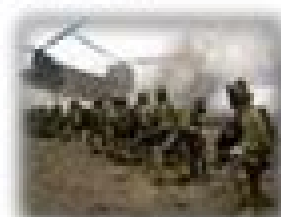
Scalable and Tailorable Joint Combined Arms Forces