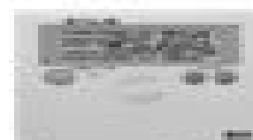
Télécommande à câble avec un affichage à cristaux liquides