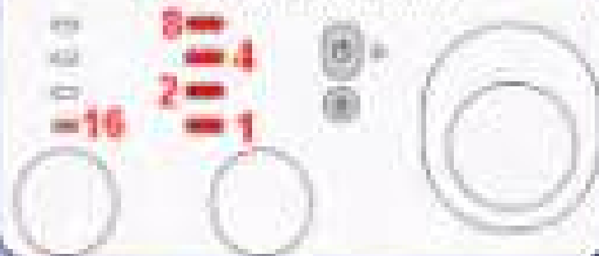
Ariston Font Panel