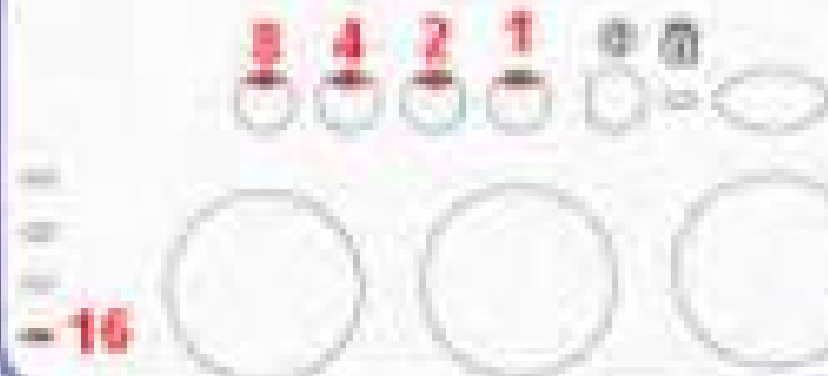
Indesit Font & Top Panel