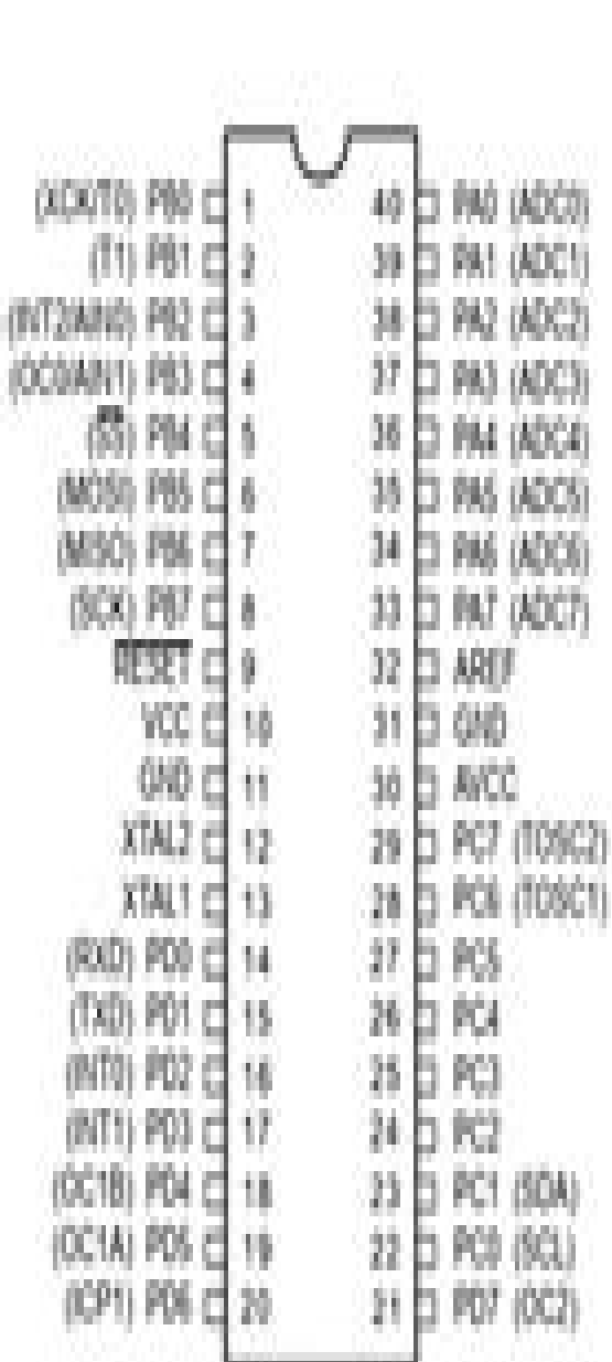
PDIP (Plastic Dual-in-Line Package)