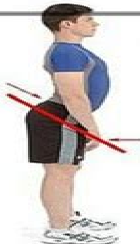
Anterior Pelvic Tilt