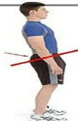
Posterior Pelvic Tilt