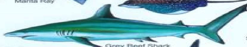
Grey Reef Shark