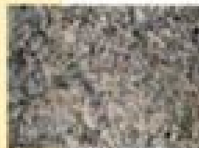
This is a photograph of a sculpture by the artist Robert Rauschenberg. It is a large, abstract sculpture made of stone, with a rough, granular texture. It is a black and white photograph of a sculpture by the artist Robert Rauschenberg. It is a large, abstract sculpture made of stone, with a rough, granular texture.

For the first time in the history of the world, the art of the mid-20th century is a time of great change and innovation. The art of the mid-20th century is a time of great change and innovation. The art of the mid-20th century is a time of great change and innovation.