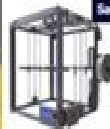
Tronxy X5S $319.99 High-precision Assembly Metal Frame 3D Printer -