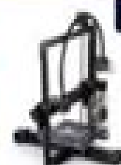
Tevo Tarantula $175.99 3D Printer