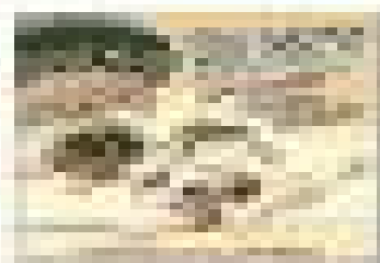
Abstract The purpose of this study was to determine the effect of a 12-week training program on the physical fitness of 10-year-old children. The study was conducted in a primary school in the city of Ankara, Turkey. The study group consisted of 20 children (10 boys and 10 girls) who were randomly selected from the school. The children were divided into two groups: a control group and an experimental group. The control group did not participate in any physical activity program, while the experimental group participated in a 12-week training program. The physical fitness of the children was measured at the beginning and at the end of the 12-week period. The measurements included heart rate, blood pressure, and body mass index. The results of the study showed that the experimental group had significantly higher heart rates and blood pressures at the end of the 12-week period compared to the control group. Additionally, the experimental group had a significantly lower body mass index at the end of the 12-week period compared to the control group. These findings suggest that a 12-week training program can improve the physical fitness of 10-year-old children.