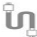
Cavo di tipo C.