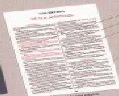
Muestra de una página

Biblia económica manual, Negra... # 15453 Biblia económica manual, Marrón... # 15456 Biblia económica manual, Azul... # 15457