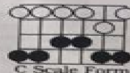
C Scale Form