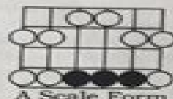
A Scale Form