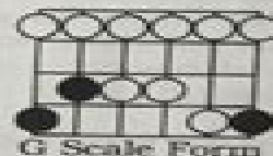
G Scale Form