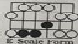
E Scale Form