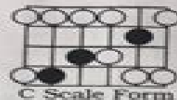
C Scale Form

When learning scales, try to play as slowly as possible for accuracy the first few times. If the first few tries are correct, it will be much easier than trying to unlearn a rush job. The best way is to play dead slow until you are familiar with the form.