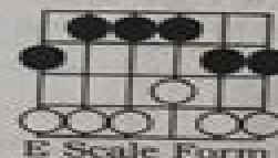
E Scale Form