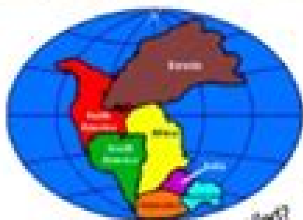
Plate Tectonics - What do you remember?