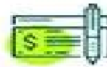
BANK CHECK PAYMENT