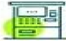
ATM CASH MACHINE