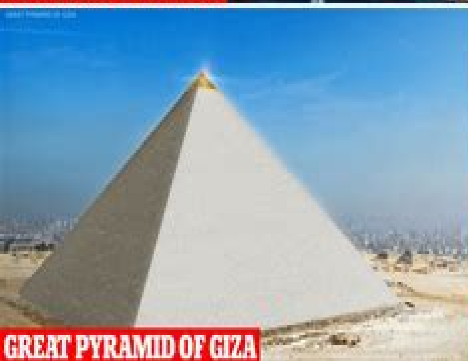
GREAT PYRAMID OF GIZA