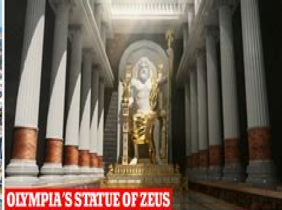
OLYMPIA'S STATUE OF ZEUS