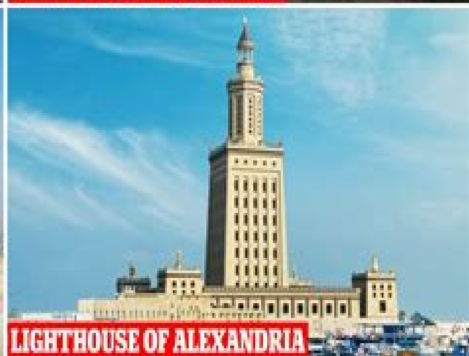
LIGHTHOUSE OF ALEXANDRIA