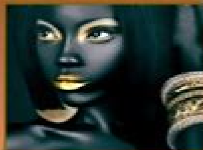
MAWU MOON GODDESS