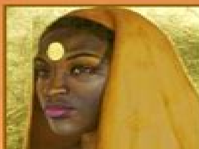
AJE GODDESS OF WEALTH