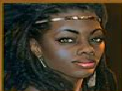
NANA BULUKU CREATOR GODDESS