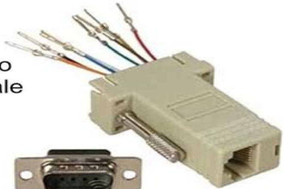
DB9 Male to RJ45 Female