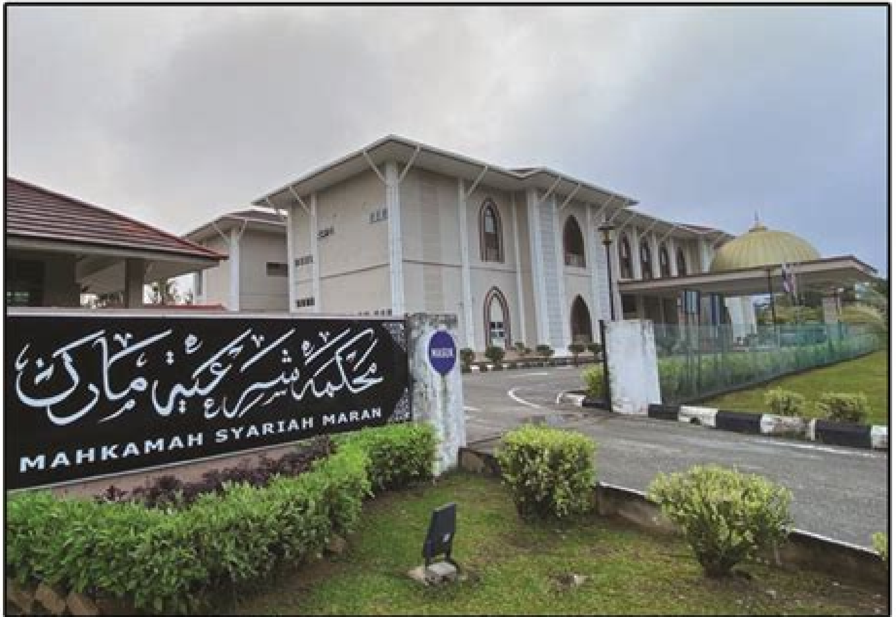
Bangunan Mahkamah Rendah Syariah Maran