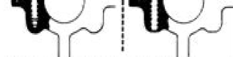
Рис. 1.27. Болты и крышки верхнего подшипника шатуна (А) и шатуна (В) шатка.