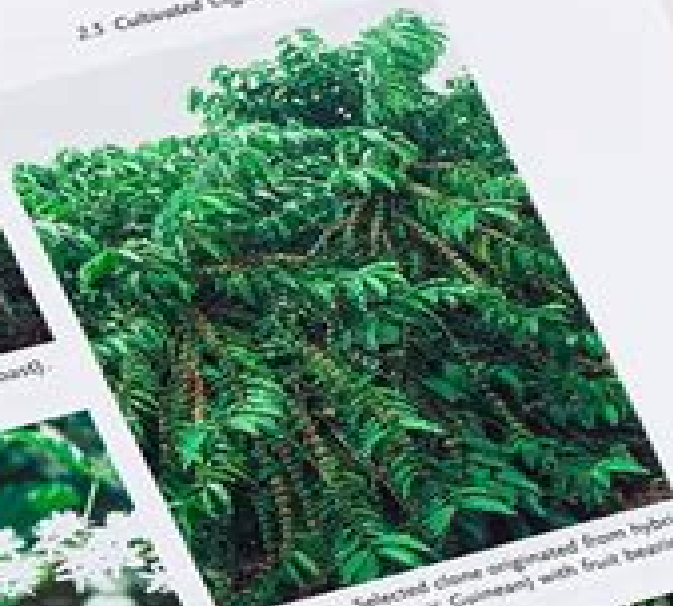
Picture 2.28 Selected clone originated from hybrid progeny (Ivory Coast). From: A. Charrier