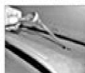
11.48 Release the retaining clip, and remove the head upper retaining bolts

43 Under the four outer mounting bolts from the face on both sides (see illustration).