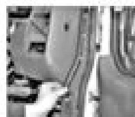
11.48 Release the retaining clip, and remove the head upper from the face on both sides