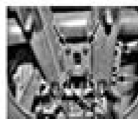
11.47 Under the six bolts (previously) securing the head, insert the support brackets to the condenser