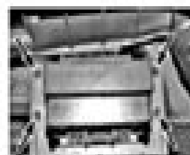
11.47 Under the four bolts (previously) securing the head, insert the mounting bracket in the block