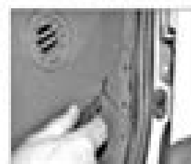
11.49 Using a small screwdriver, release the bolt covers from the face on both sides