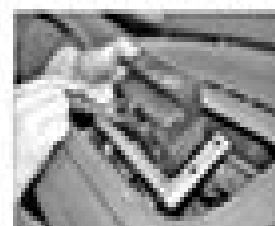
11.48 Release the retaining clip, and remove the head from the top of the conditioned only further from the mounting bracket