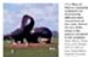
This is a photograph of a sculpture. The sculpture is made of a dark, possibly black, material. It has a complex, organic shape with many protrusions and indentations. It is set against a light, textured background.