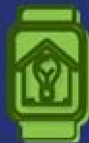
Controlling and instrumentation Applications Smart Biosensing