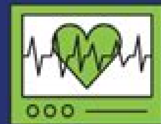
Optimization and storage of medical signals