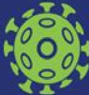
Detection of Cancerous cells using AI