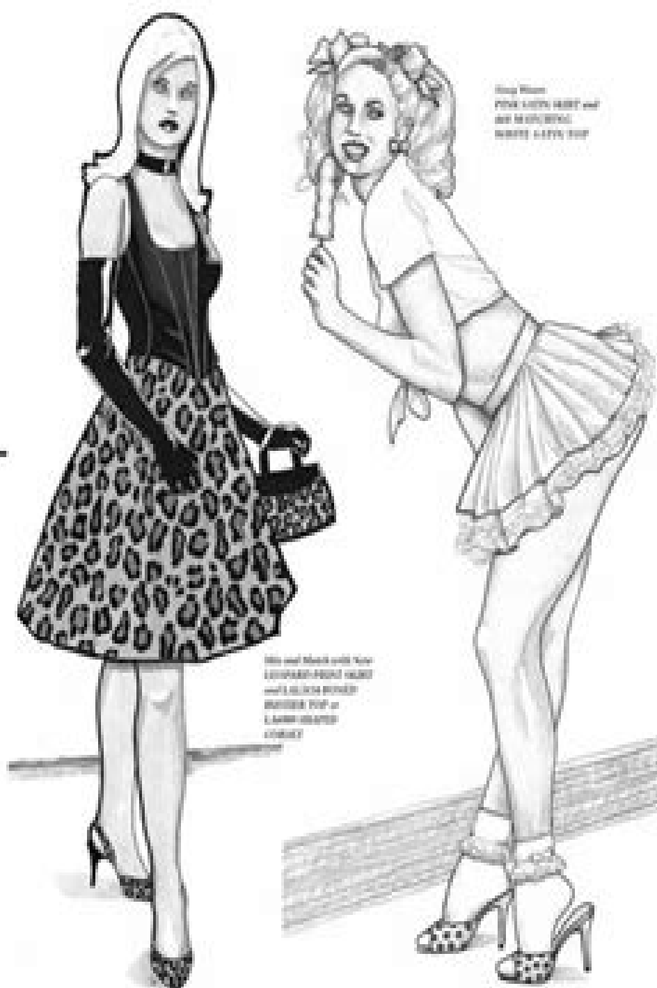
100% Cotton 100% Cotton 100% Cotton 100% Cotton

We have being shown the best and friends and helped her, showing her my puppy with her mouth while lying with her head like this colors of their skin but not in the picture she made them William, New