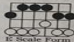
E Scale Form