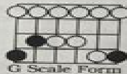
G Scale Form