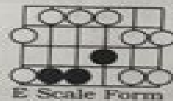
E Scale Form