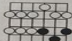
D Scale Form