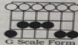
G Scale Form