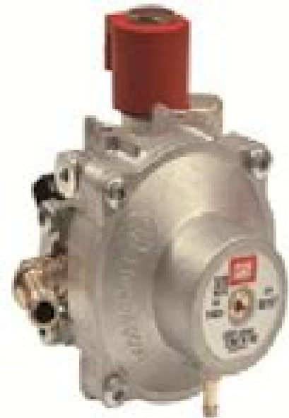
ZENITH REDUCER - CNG