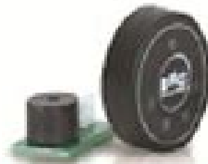
ONE TOUCH CHANGEOVER SWITCH CNG / LPG