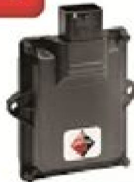
GAS ECU - CNG / LPG