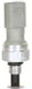
PTD SENSOR (SHRAU) LOW PRESSURE - CNG / LPG