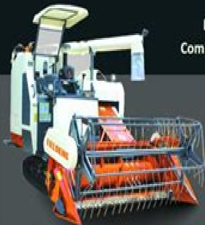
Multi Crop Combine Harvester