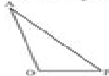
diagram not to scale