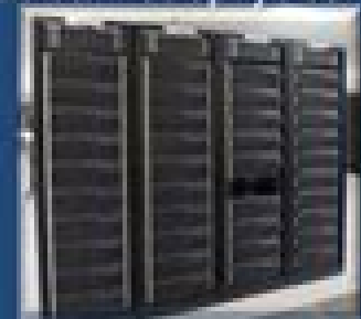
Theory & Computation