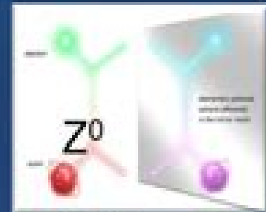
Fundamental Forces & Symmetries