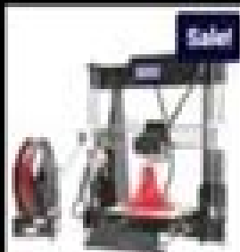
Anet A8 Desktop 3D Printer - Black $146.99 w/Coupon