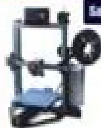
Zonestar Z5F $209.99 Fast Installation DIY 3D