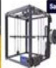
Tronxy X5S $319.99 High-precision Assembly Metal Frame 3D Printer -