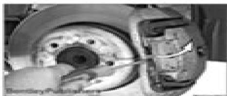
Detailed brake pad and rotor service. 340 Brakes