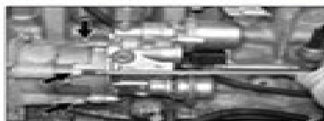
Servicing the high-pressure fuel system on turbo models, including replacing N57 fuel pump. 160 Fuel Tank and Fuel Pump