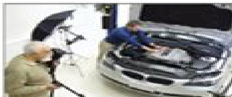
Bentley technical editors removing motor cover on V8 (N62) engine.

The do-it-yourself BMW owner will find this manual indispensable as a source of detailed maintenance and repair information. Even if you have no intention of working on your vehicle, you will find that reading and owning this manual makes it possible to discuss repairs more intelligently with a professional technician.