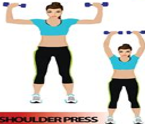
SHOULDER PRESS 10 - 15 REPETITIONS