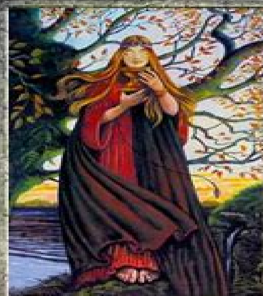
PRINCESS OF CUPS