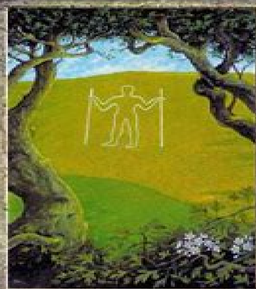
TWO OF WANDS