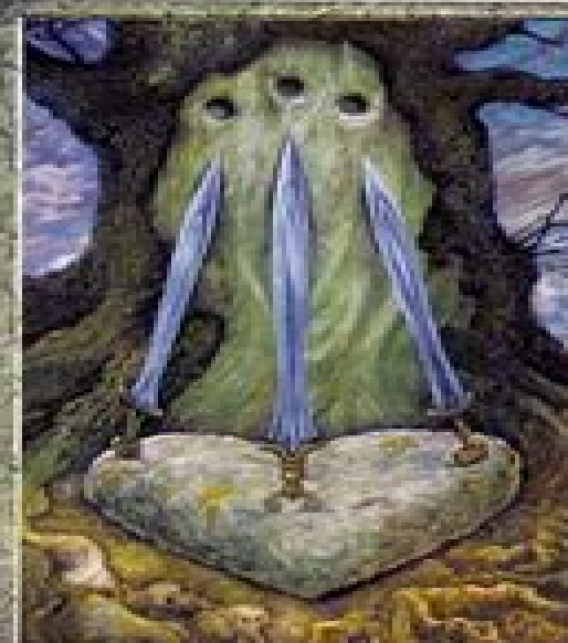
THREE OF SWORDS