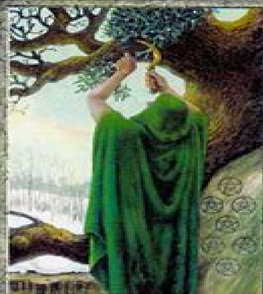
SEVEN OF PENTACLES