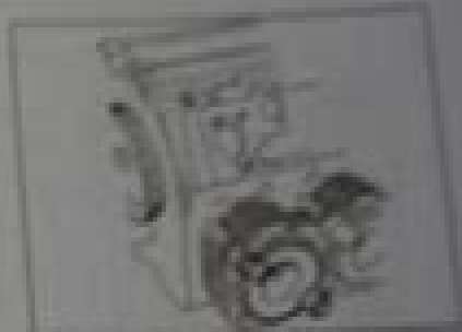
Fig. 36 - Typical view of main bearings during crankshaft installation.