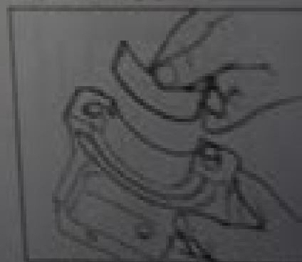
Fig. 38 - Fitting the main bearing shell to the main bearing cap.

There should be the clearance is 1 mm (0.04 inch) between the crankshaft and the main bearings. If the clearance is 1 mm (0.04 inch) or more, the crankshaft must be replaced.