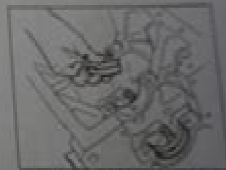
Fig. 37 - Main bearing cap gasket installation.